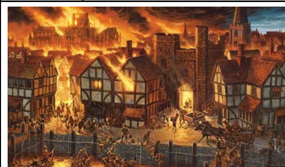
View of the fire from the river