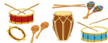
Untuned Percussion Instruments