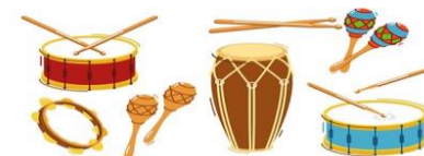
Untuned Percussion Instruments