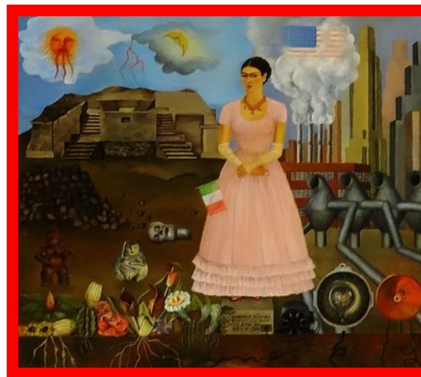
Frida explored themes of identity in her work.