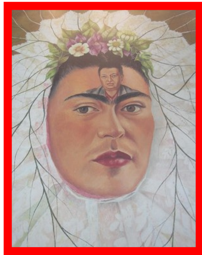
Frida was proud to look different, and painted her moustache and bushy eyebrows into her self-portraits.