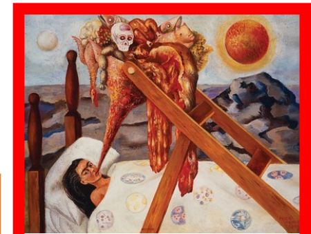
Many of Frida's paintings showed themes of disability and illness .